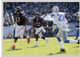
GRADING THE BEARS: Week 10 vs. Lions