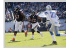
GRADING THE BEARS: Week 10 vs. Lions