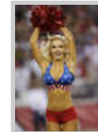
Weekend Watch: Nick Foles, Drew Brees, Jay Cutler and cheerleaders